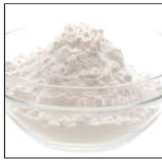
UNBLEACHED FLOUR B286 -100418