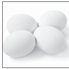
WHOLE EGGS A566 - 100047