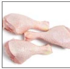
CHICKEN LEGS A518 -100113