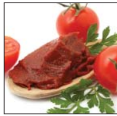
TOMATO PASTE A048 -100332