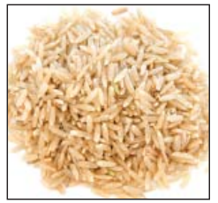
BROWN RICE B545 -100499

Let your menu drive what commodities you process and take advantage of our simple processing procedure today!