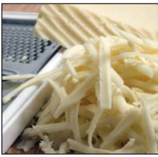
MOZZARELLA CHEESE B077- 100042